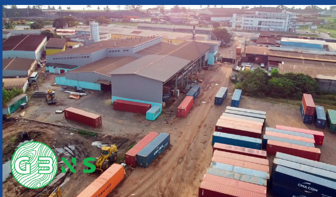
Basso Legnami production facilities in Gabon

Basso Legnami especially has a long history of direct presence on African soil, where it has production and marketing exclusives.